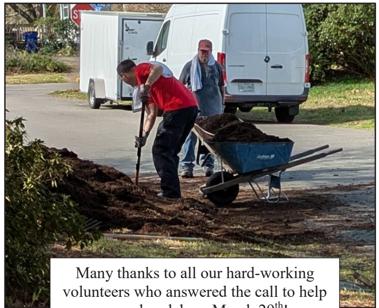
Many thanks to all our hard-working volunteers who answered the call to help spread mulch on March 29 th !