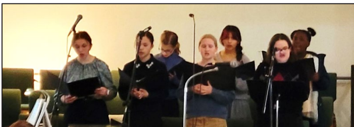
Many thanks to our Youth Choir for leading us in worship at our Youth Masses each month!