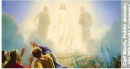
Carl Bloch, public domain, via Wikimedia Commons

March 16, 2025 Second Sunday of Lent Gn 15:5-12, 17-18 | Phil 3:17-4:1 | Lk 9:28b-36