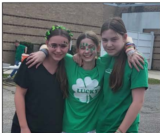
St Patrick's Day Parade 2024