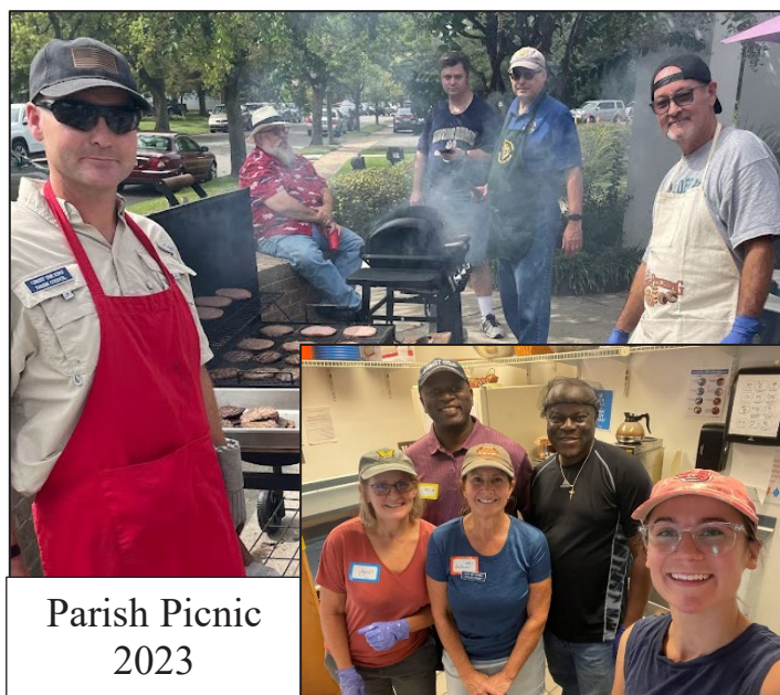
Parish Picnic 2023