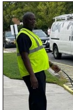
First Day of School 2023-2024