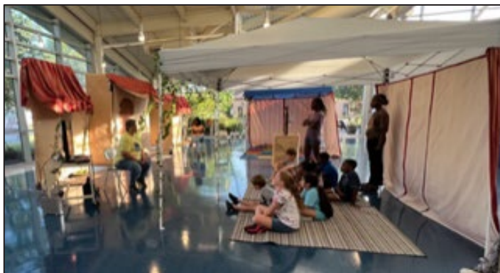
VBS 2023 – Day 1

Classes for Grades PreK to 8 are held on Sunday mornings between the Masses and training is provided. Contact Janet Ficca for more info.