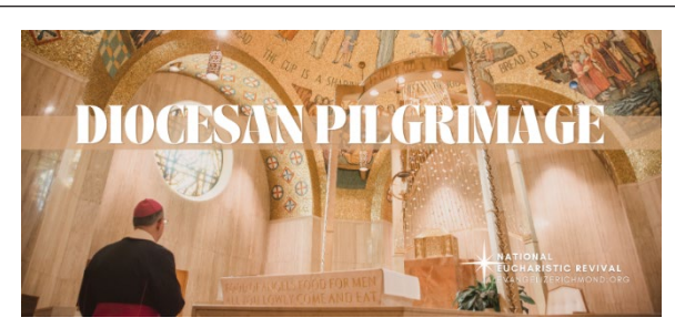
Basilica of the National Shrine of the Immaculate Conception, Washington, D.C. Saturday, October 21, 2023

All 10<sup>th</sup> graders and up are invited to participate.