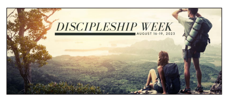
Discipleship Week for 10<sup>th</sup> – 12<sup>th</sup> Graders August 16<sup>th</sup> – 19<sup>th</sup>

ENGAGE This world often tells us to do what makes us happy. Let's challenge ourselves to, instead, do what makes us holy, as we keep our eyes fixed on the path to eternity.