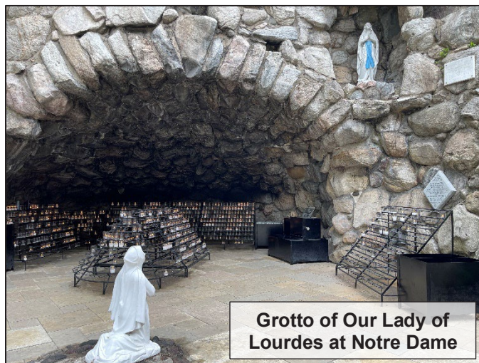
Grotto of Our Lady of Lourdes at Notre Dame