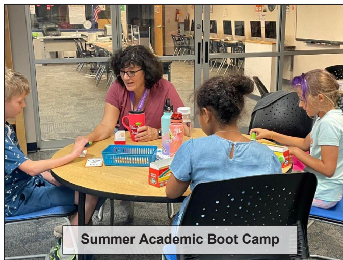
Summer Academic Boot Camp