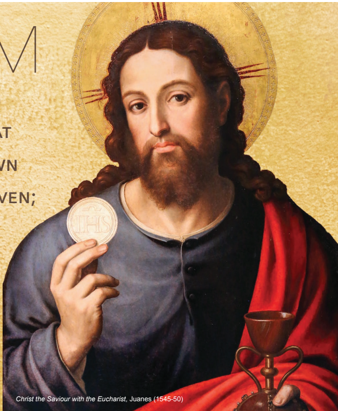
Christ the Saviour with the Eucharist, Juanes (1545-50)

THE LIVING BREAD THAT CAME DOWN FROM HEAVEN; WHOEVER EATS THIS BREAD WILL LIVE FOREVER. JOHN 6:51