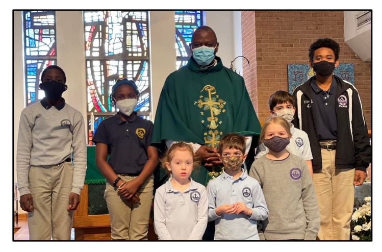
Congratulations to our February's Peacemakers for Honesty

Would you like to proclaim the Word of God at Mass? All baptized adults and youth in Grade 7 and up are invited to be a reader or commentator. Please contact our parish office for information on training and scheduling.